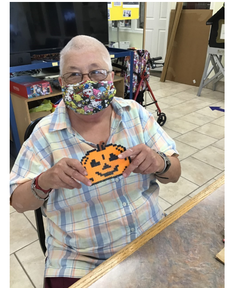
Pumpkin Bead Creation