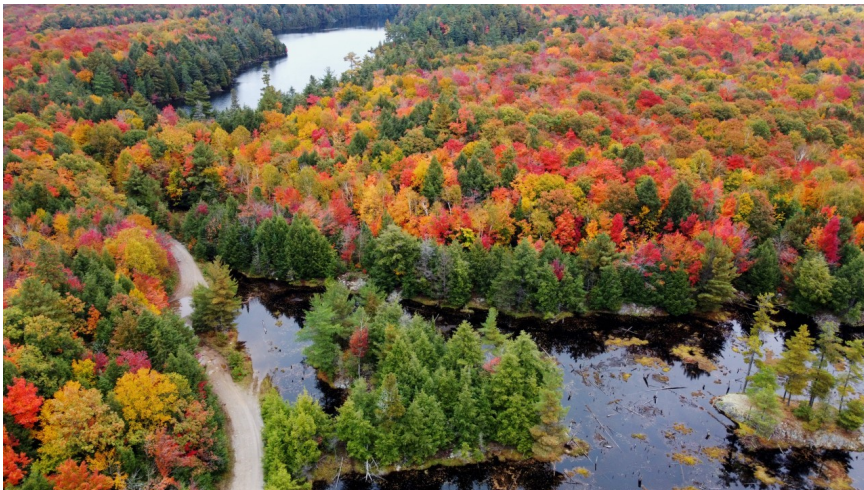
Amazing drone shot taken by one of our members.