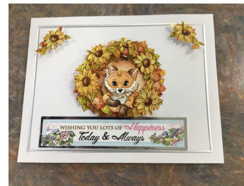
Fall Greeting Cards