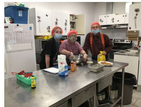
Making Banana Bread